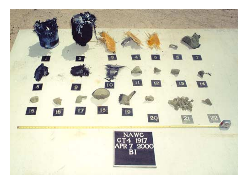
FIGURE 7. Material Recovered Following Bullet Impact Testing of IM Motor.