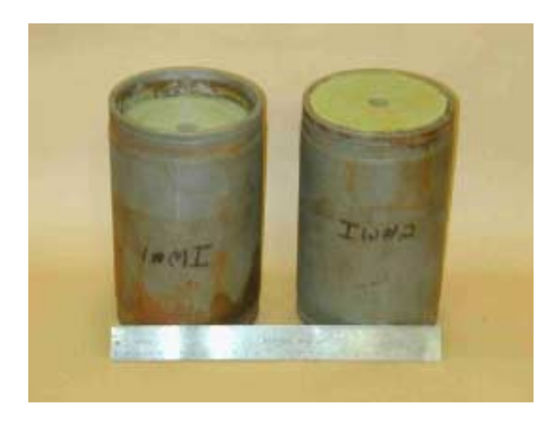
FIGURE 3. Analog Motors Used for Verification of Low-temperature Storage Capability.