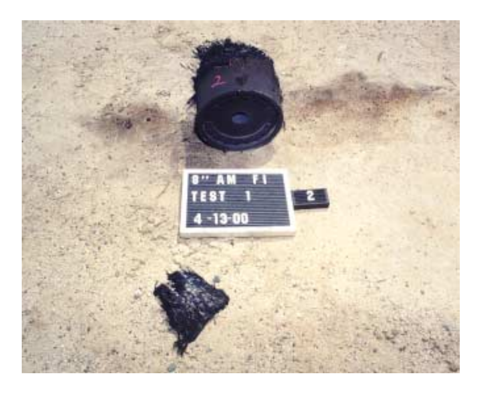
FIGURE 8. Material Recovered Following Fragment Impact Testing of IM Motor.

The fragmentation impact test was conducted on 13 April 2000. One 8-inch analog motor loaded with 53 lb of propellant was subjected to the fragmentation impact environment of MIL-STD-2105B. Five fragment cubes were propelled at the motor at 8100 feet per second. A fireball was seen as the motor was impacted and the motor broke into several pieces. Venting and burning continued for 1 minute and 18 seconds. Ninety-two percent of the non-energetic material and 5% of the energetic material were recovered after the test. The aft end of the motor is shown in Figure 8. The Ordnance Hazard Evaluation Board judged this a Type V (Burn) reaction.