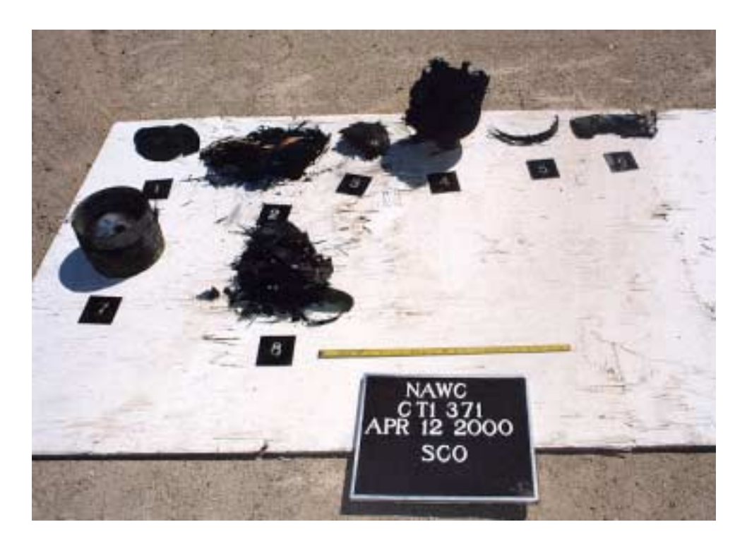
FIGURE 6. Material Recovered Following Slow Cookoff Testing of IM Motor.