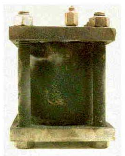
Modified NEPE Propellant

The results of some early slow cookoff screening tests with an HTPB propellant and a modified NEPE propellant are shown in Figure 1. Both propellants were aluminized, contained nitramine and AP, and exhibited similar performance and burn rates. The small cookoff bombs (SCBs), essentially closed pipes, each held about 1 lb of propellant. Each SCB was instrumented with two thermocouples, one placed near the case wall and one in the center of the propellant. A vent hole was used to simulate a nozzle and sized to accommodate normal propellant burning at room temperature at a pressure consistent with the rocket motor of interest.