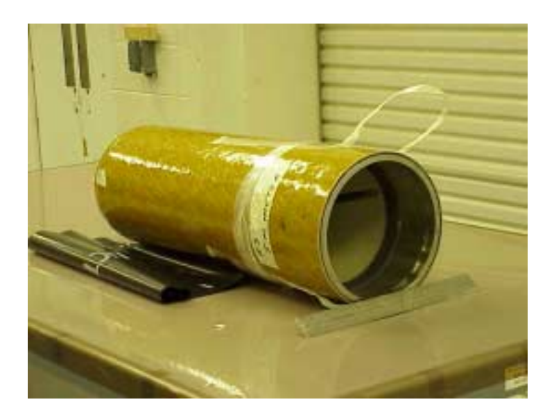
FIGURE 4. Eight-inch-diameter Test Bottle (IM Motor Without Dummy Nozzle) Loaded With MPE Propellant

All the mixed polyether propellant tests were performed at NAWCWD on live 8-inch analog motors loaded with 53 lb of boost propellant developed by Thiokol Propulsion. One of the IM motors is shown in Figure 4. The composite cases, provided by NAWCWD, were specifically designed for screening new propellants for IM and performance properties.<sup>8</sup> The motor case was an epoxy-resin-impregnated carbon fiber with Kevlar® overwrap and contained no igniter. A 1.25-inch-diameter hole in the aft plate served as a dummy nozzle. The test article was8 inches in diameter and 29 inches in length, with a total weight of 104.9 lb. These tests were not performed for score. Post-cure X-ray analysis of the loaded motors showed them to be free of propellant–liner debonds and free of propellant voids.