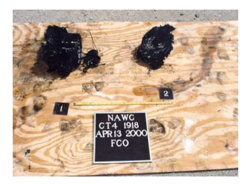
FIGURE 5. Material Recovered Following Fast Cookoff Testing of IM Motor.

The fast cookoff test was conducted on 13 April 2000. One 8-inch analog motor loaded with 53 lb of DL-N240 propellant was subjected to the fast cookoff environment of MIL-STD-2105B. The unit was instrumented with five thermocouples. One measured internal temperature and the other four measured flame temperature across the length of the motor. The flame temperature reached 1000°F 35 seconds after the fuel was ignited. From that time until venting of the motor was first seen and heard, the average temperature was 1748°F. Venting ceased at 3 minutes, 2 seconds. Eighty-seven percent of the non-energetic material was recovered directly under the test apparatus, with forward and aft motor pieces being shown in Figure 5. The Ordnance Hazard Evaluation Board judged this a Type V (Burn) reaction.